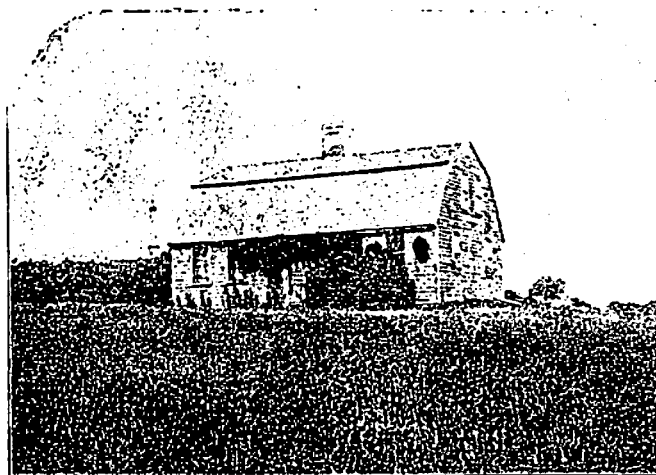
Alexander Standish House.

Within a short walking distance is the Standish House, built in 1666, and the Standish Monument, finished in 1889. With the exception of the Washington Monument, this is the highest pedestal erected to the memory of a single person. The Standish House was occupied by Alexander, the son of Myles Standish, who married the daughter of John and Priscilla Alden; names which have become household words through Longfellow's poem.